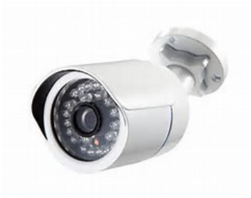
Hopefully, thanks to the fine work of the Richmond SIT, these criminals will be locked up for some time. Great work!

After an intensive investigation, a trio of burglary suspects were arrested and charged for the burglary. Furthermore, the three have also been charged with a slew of additional commercial burglaries throughout San Francisco.