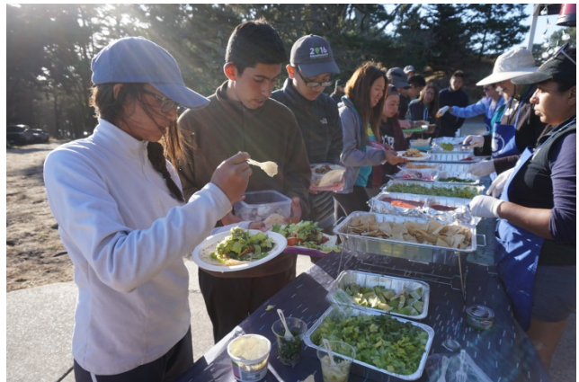
"Packing the Parks" Program Participants at West Fort Miley, July 2016