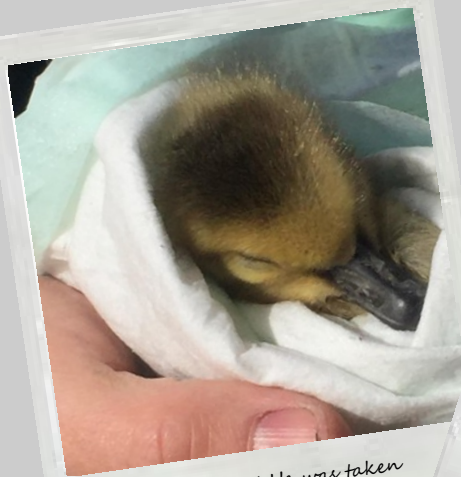
Poor little guy! He was taken away and cared for by ACC.