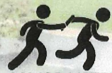
4 X 100 METER RELAY (FOUR PERSON TEAMS)