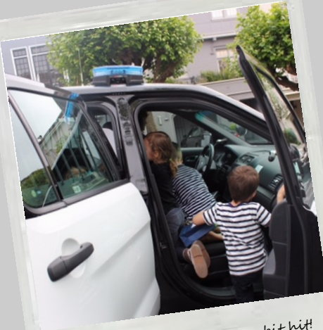
As always, the police car is a bit hit!