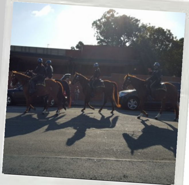
The mounted unit showed up too!