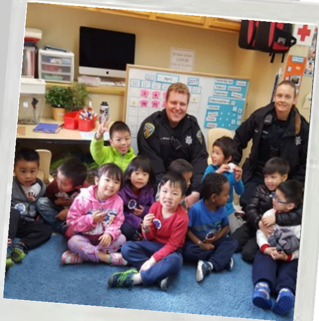
Awesome group photo!!!