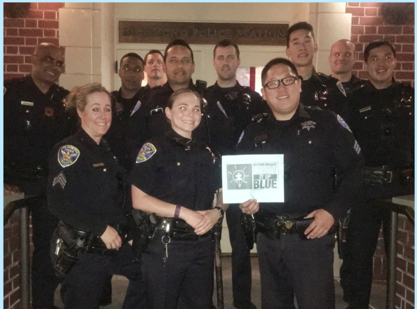
Officers from Richmond Station's midnight watch 'Light it up Blue.'