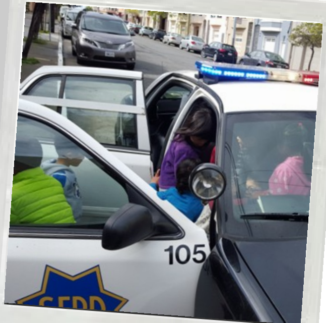
How many kids can we fit in a car?