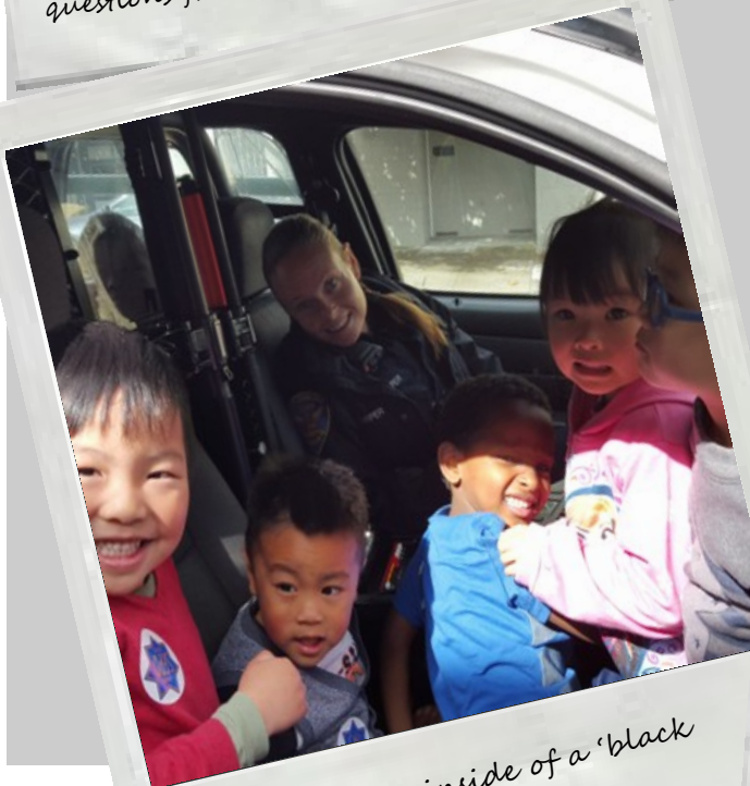
Checking out the inside of a 'black and white.'