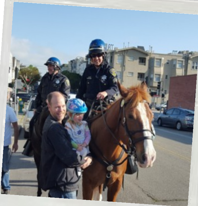
Great opportunity to take a photo with the horses!