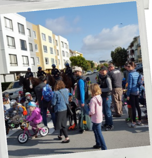
All the kids arrived safely at Laurel Hill Nursery School