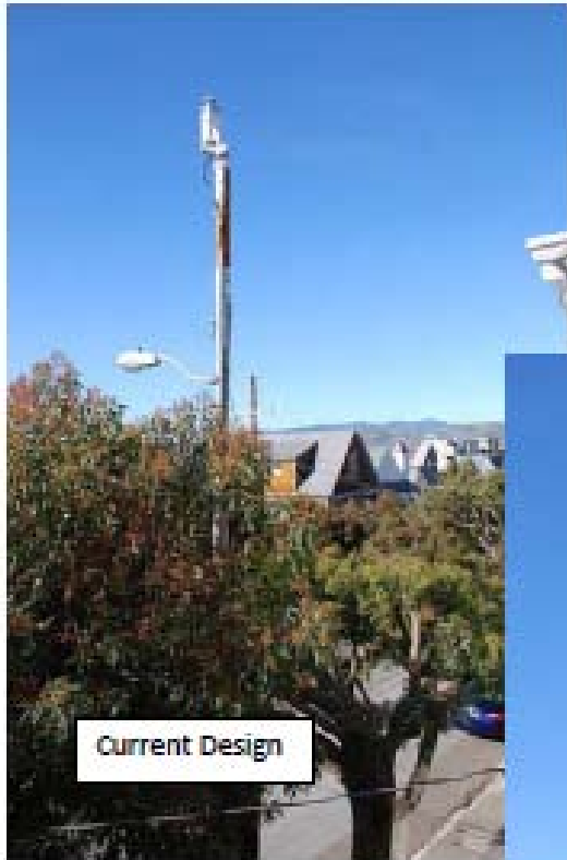
Photo Simulation of Planning Department Approved Configuration from Bedroom