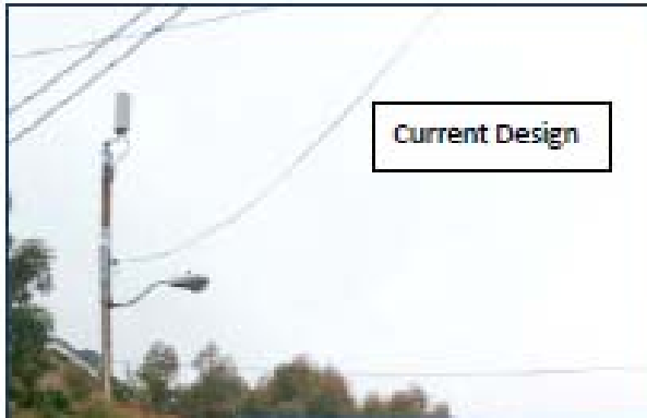
Photo Simulation of Planning Dept Approved Configuration from Street

Proposed redesign to modify site to conform to the configuration approved by planning department