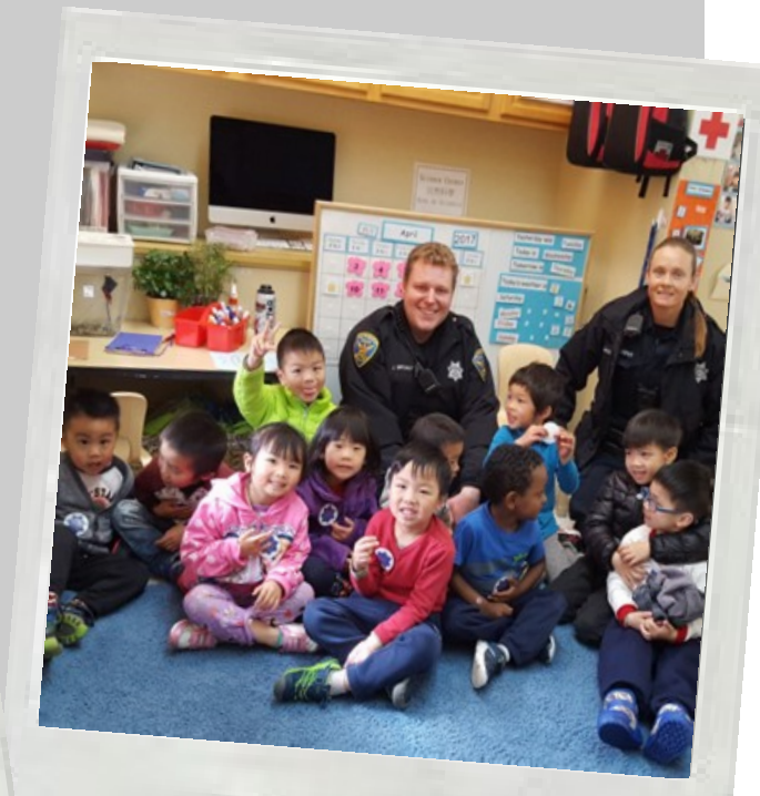
Awesome group photo!!!