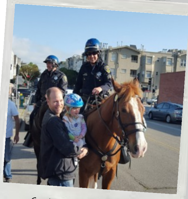
Great opportunity to take a photo with the horses!