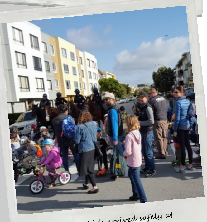
All the kids arrived safely at Laurel Hill Nursery School