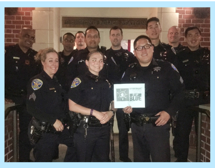
Officers from Richmond Station's midnight watch 'Light it up Blue.'