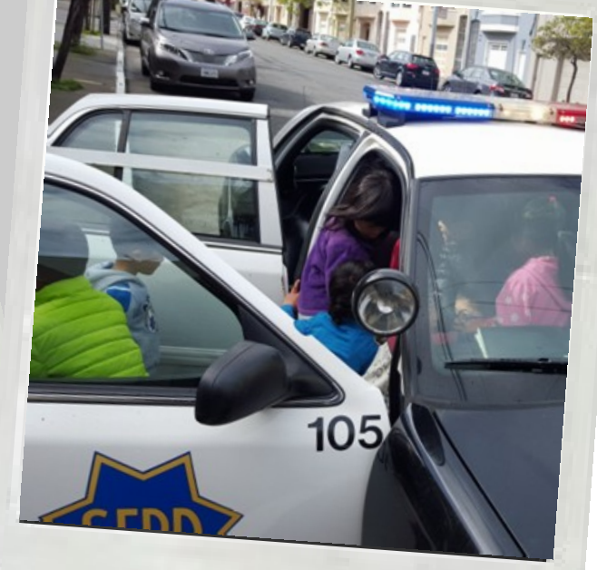
How many kids can we fit in a car?