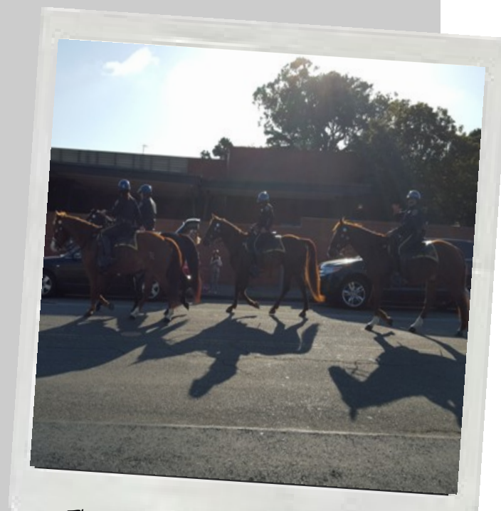
The mounted unit showed up too!